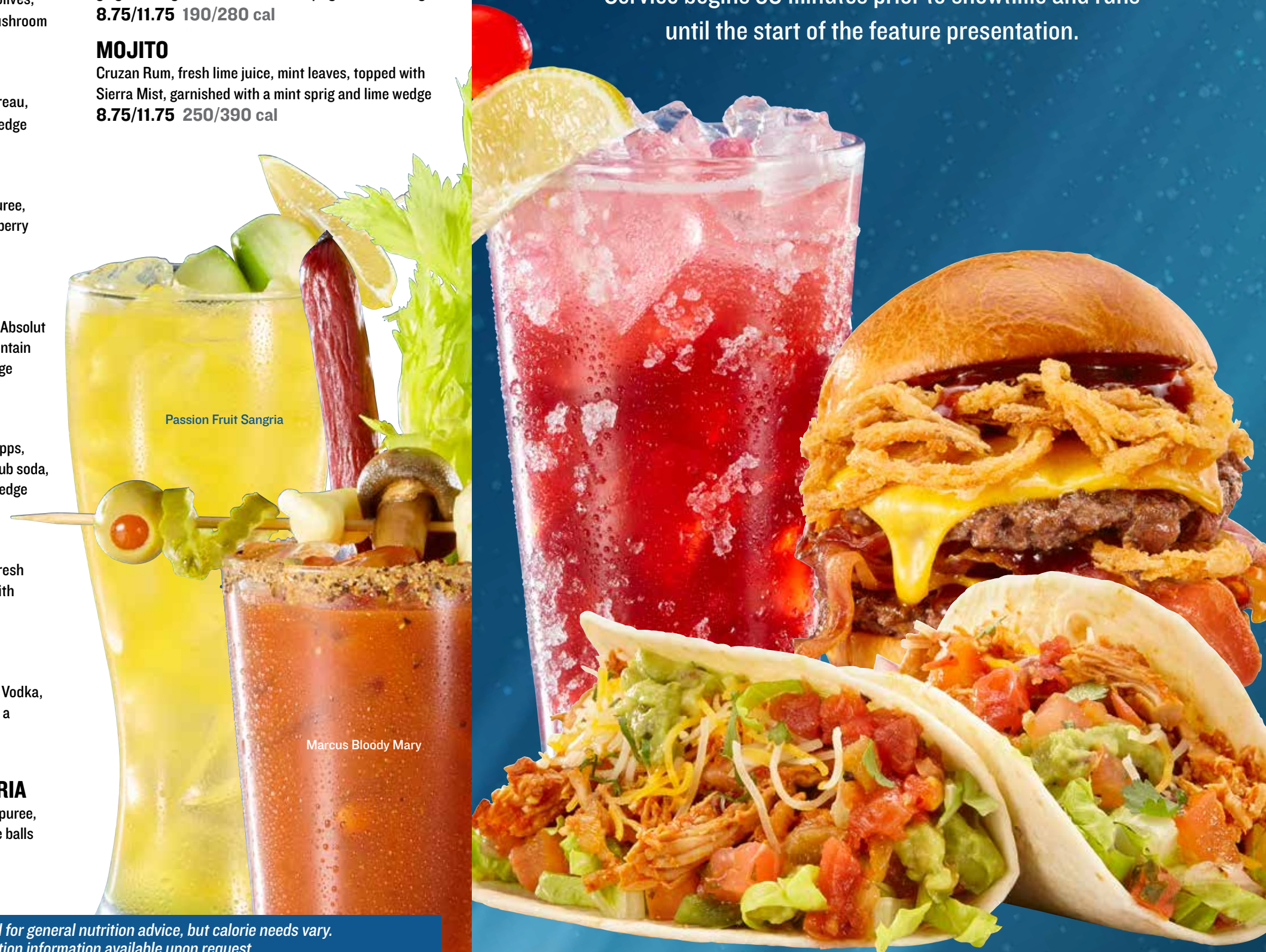
Passion Fruit Sangria

Cruzan Rum, fresh lime juice, mint leaves, topped with Sierra Mist, garnished with a mint sprig and lime wedge 8.75/11.75 250/390 cal